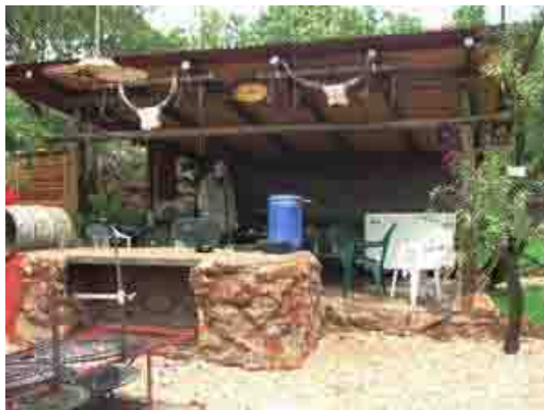
Sit/ braai area