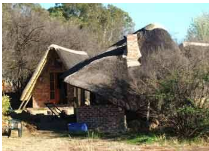
A Frame & kitchen lapa

All rates are pp sharing (single rates on request)