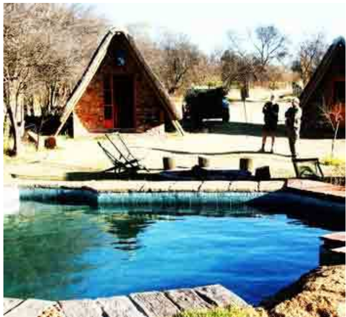
A Frame and swimming pool